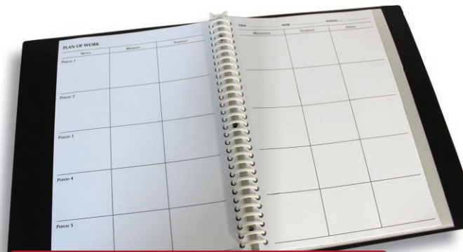
Vertical period format