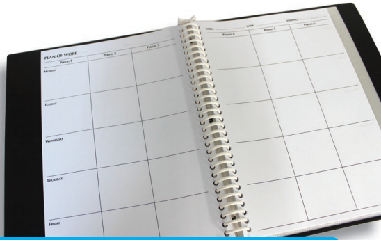
Standard horizontal format